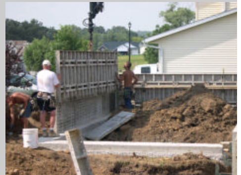
3. Viola! The top 4' form is then set into place in the next section!