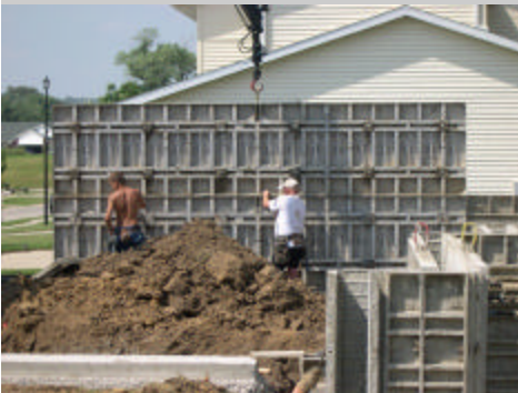
1. 4' forms bolted on top of one another being set for first section. Then, unbolt the two forms to release the top panel....

Follow these three steps to save time and forms by bolting together 2-4' high forms to set walls like these in the garage area of a house or any job where you're using 4' high forms.