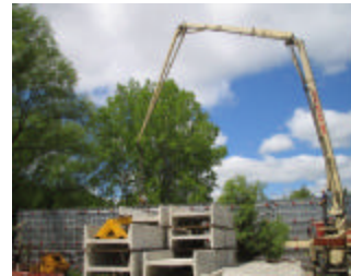
Van Wyk's pouring 18' high wall shop addition with their pump.