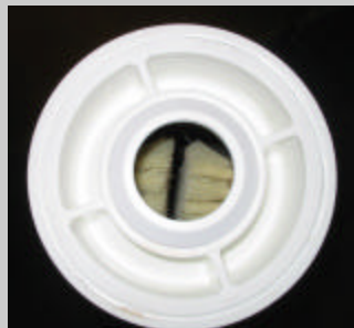
Insert & remove tie to quickly grease evenly.

B.E.P. now offers a Tie Greaser made entirely of PVC to hold and evenly distribute grease on your taper ties. Inside the tube( see right) are two hard bristled brushes to ensure no extra grease is wasted by swiping off just enough grease on the tie for each pour. A stand is available for even more flexibility. Call us for more info.