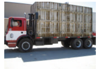
1st set of Esker's B.E.P. Forms & Hauler.

Like the Esker's in Illinois, Martinson Construction in Waterloo, Iowa already had a set of B.E.P.'s only their first set was Smooth. Martinson's decided to add on a second set of Vertical Textured 9' B.E.P.'s because of the demand for