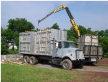
Nyce Concrete's B.E.P. Form Hauler

Nyce Concrete took delivery of their smooth 8' x 9' Rotator panels in June. Upon arrival of their forms, Nyce Concrete outfitted a flat-bed truck with slats to haul all their B.E.P. forms. The very day the forms were delivered they were set on a residential basement. Even without having worked with the B.E.P. forms before, Nyce's skilled men set and poured the wall that day. The B.E.P. forms integrated seamlessly with Nyce's handset forms and continue to enhance production day in day out.