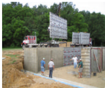
Esker's 9' x 21' long B.E.P being stripped.

"They take the guesswork out for our guys and really almost set themselves. All you need to strip a job are two men and a crane."