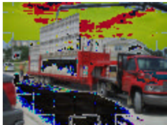
Martinson's B.E.P. hauler & 21' Vertical Textured panel.