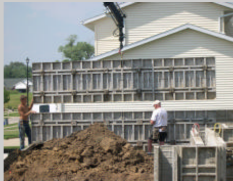
2. Simply lift the top 4' form off the bottom form that's set in place.....